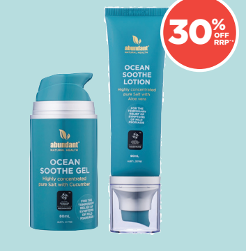
Abundant Natural Health Ocean Soothe Skincare Range