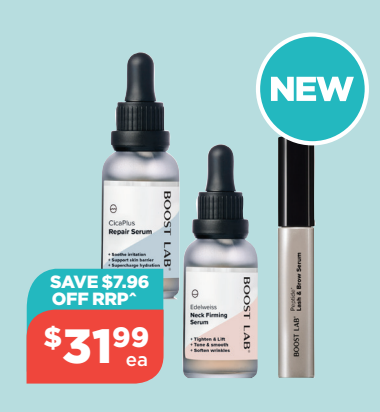
Boost Lab Serum 30mL (Selected Variants)