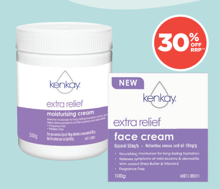
Skincare Range (Selected Variants)