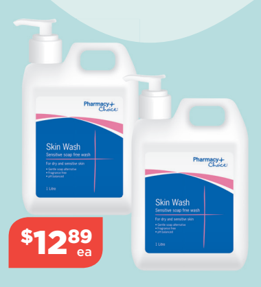
Pharmacy Choice Skin Wash 1 Litre

Blistex Intensive Repair Balm 7.25g or Pot 7g