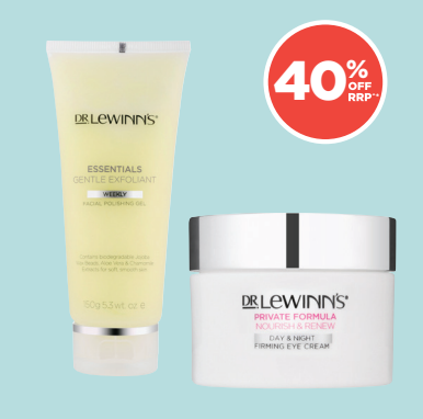
Dr Lewinn's Skincare Range (Selected Variants)