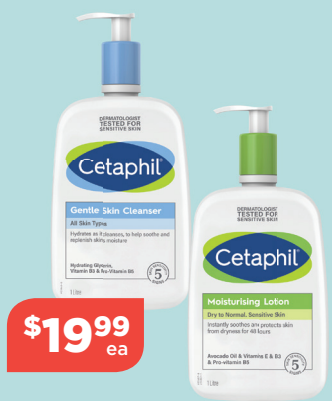
Cetaphil Gentle Cleanser or Moisturising Lotion 1 Litre