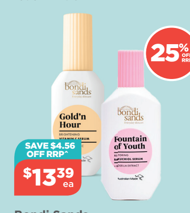
Bondi Sands Skincare Range (Selected Variants)