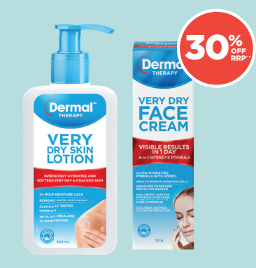
Dermal Therapy Skincare Range (Selected Variants)